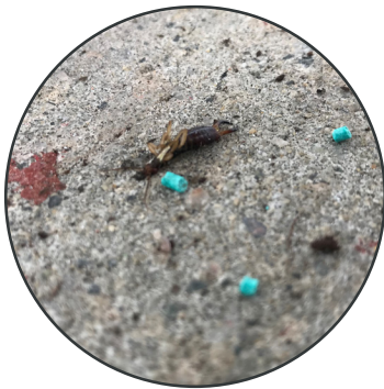
Imtrade Transcend® and Earwig 2018

Invertebrate pests of Australian Broad-acre cropping have generally arisen from incursions onto the Australian mainland by foreign species introduced via various human activities. Whilst a number of these species have been present in Australia for some time without having a significant effect on production systems, it has been the recent adoption of moisture and stubble retention based agro-systems that has seen the pests rapid rise to prominence in some regions.