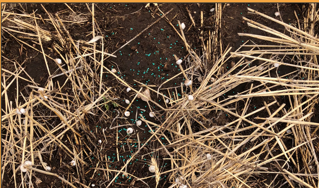
Use of Imtrade Transcend® in Canola is pending registration with the APVMA.

..... “Growers do not need to change their practices of machinery to accomodate Imtrade Transcend”